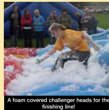
A foam covered challenger heads for the finishing line!

CSEF would like to offer their special thanks to the Vodafone Good Causes Team and their staff.