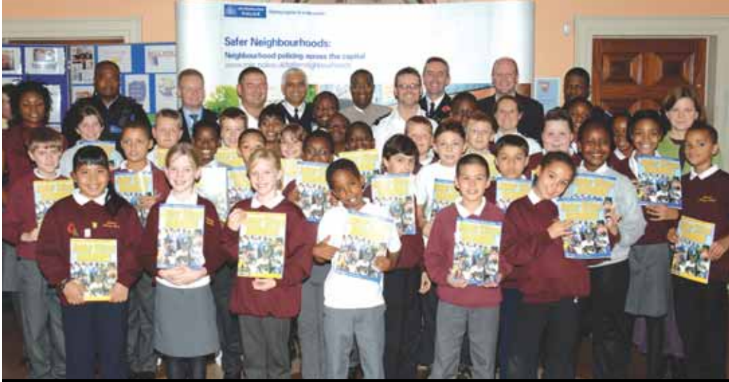
Representatives from the Emergency Services are joined by teachers and pupils from Dalmain Primary School in Forest Hill who attended the Lewisham event.

Over the past seven years, CSEF has assisted in the development and distribution of teaching materials that the Metropolitan Police Service distributes to children in primary and secondary schools across London. Last year over 40,000 Year 6 children received their own personal copy of the Junior Citizen Handbook and over 20,000 Secondary School children received our Street-Vibe resource.